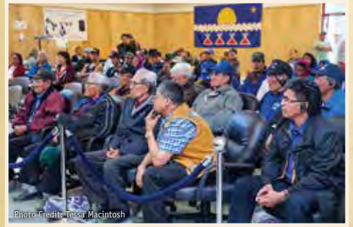
Tłįchǫ Gathering Gamètì 2015

The 3rd Assembly has been busy in 2015-2016. We are pleased with the growth of our Capital Trust investments. We are also pleased with the establishment of a regional Tł<sub>2</sub>ch<sub>0</sub> Economic Development Working Group, the development work on a mineral policy and the implementation of our On the Land Safety policies, the ongoing work in establishing an early childhood framework, the continuing work on the Sportsplex in Behchok<sub>0</sub> and the all-season road to What<sub>1</sub>. We are proud to have implemented the Tł<sub>2</sub>ch<sub>0</sub> Awards this year. Some highlights include: