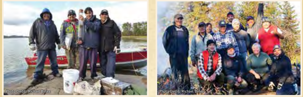
Participants of the 2015 TAEMP at Tumi Lake.

The second triennial report from the Cultural Coordinator, "Gonàowot'a nàts'etso; Eelets'àts'edi t'a nàts'etso – Strong in Way of Life, Strong in Working Together", will be released in the next year and it is intended to draw attention to the obligations of all governments to use their respective powers in ways that respect and promote Tł<sub>2</sub>ch<sub>0</sub> language, culture and way of life.