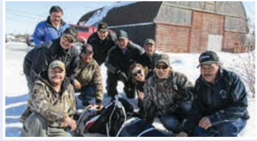
Wilderness Safety Program Participants

2013-2014 saw the implementation by the Tłącho Government of a comprehensive Occupational Health and Safety strategy for both the office workplace and for projects on the land. A committee of management and staff developed comprehensive policies and an implementation strategy. Managers, including the Community Directors, received extensive training in workplace safety issues and an introduction to the Wilderness Safety Program.