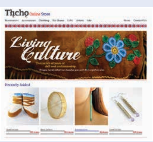
The Online Store at www.tlicho.ca http://www.tlicho.ca

We have provided funding to support postsecondary students in education, promoted recreational activities with school age students, provided harvest subsidies to all citizens and crisis funding to families who have members who are severely sick, while bringing together elders and families for funerals.