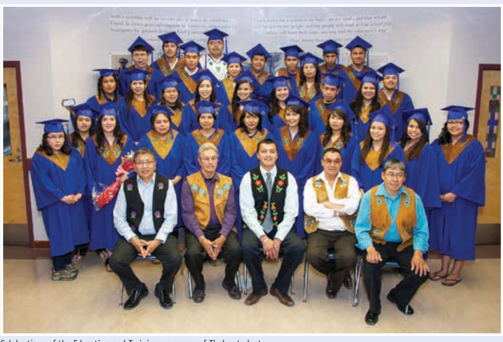
Celebrations of the Education and Training successes of Tłįchǫ students