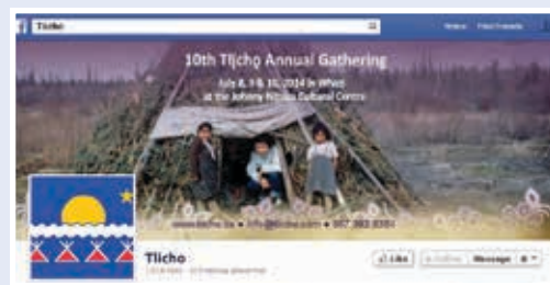
Tłicho Government at www.facebook.com/Tlicho http://www.facebook.com/Tlicho