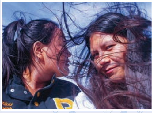
Įmbè Program Participants