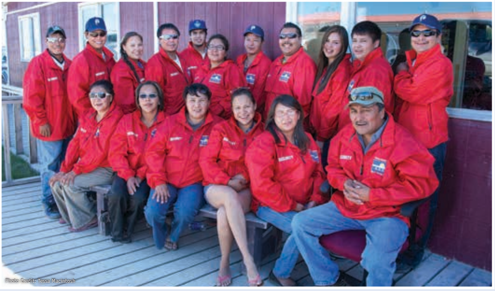
Security Staff during the Annual Gathering