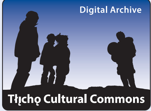
Tłįcho Cultural Commons logo

The Tłącho Research and Training Institute was created within the Department of Culture and Lands Protection in 2013 by the Chief's Executive Council. The purpose of the Institute is to advance the study of our lands, language, culture and way of life. In 2013-2014, one of the major projects of the TRTI has been the development of the Tłącho Cultural Commons Digital Archive, which has over 2.5 TB of information and over 28,000 Tłącho items in four formats: pictures, film and video, documents and sound recordings. The Digital Archives can currently be accessed at Tłącho Government offices in Behchokò and in Yellowknife, and at the Tłącho Community Services Agency in Behchokò.