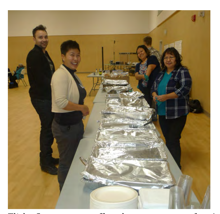
Tłįcho Government staff ready to serve a tasty feast!

"...we have to continue to protect what is most important to our Elders - the land, water and the wildlife".