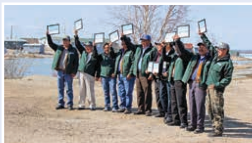
Certification for the Wilderness Safety Program