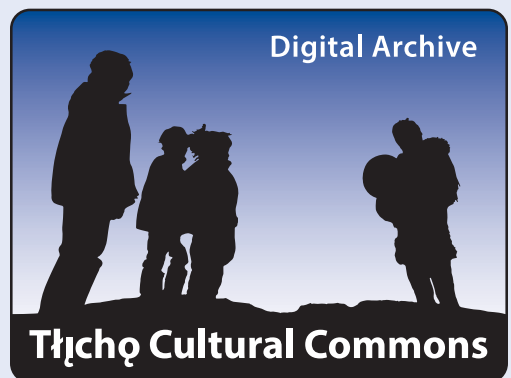
Tłı̨chǫ Cultural Commons logo

The Tłı̨chǫ Research and Training Institute was created within the Department of Culture and Lands Protection in 2013 by the Chief's Executive Council. The purpose of the Institute is to advance the study of our lands, language, culture and way of life. In 2013-2014, one of the major projects of the TRTI has been the development of the Tłı̨chǫ Cultural Commons Digital Archive, which has over 2.5 TB of information and over 28,000 Tłı̨chǫ items in four formats: pictures, film and video, documents and sound recordings. The Digital Archives can currently be accessed at Tłı̨chǫ Government offices in Behchokò and in Yellowknife, and at the Tłı̨chǫ Community Services Agency in Behchokò.