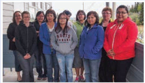
Managers at the Management Development Training Program

Restructuring of the TG Departments has continued, with significant work continuing with three of the four new Departments. Management structures have been put in place and co-location of similar functions has been achieved. The Management Development training program has continued this year as well as Occupational Health and Safety training, both within government and for people in the communities who participate and lead on-the-land activities.