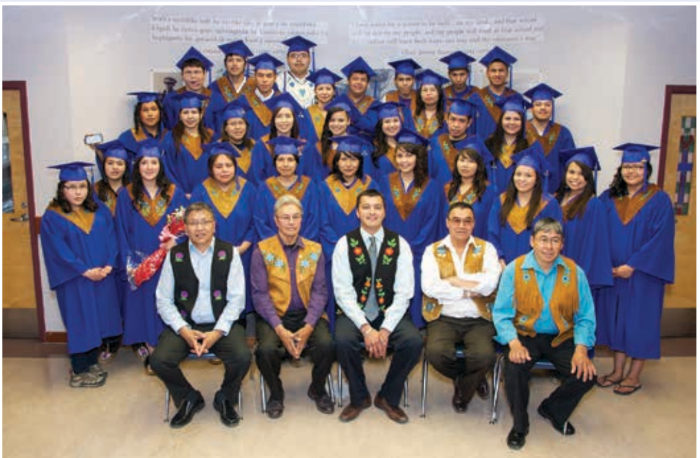
Celebrations of the Education and Training successes of Tłı̨chǫ students