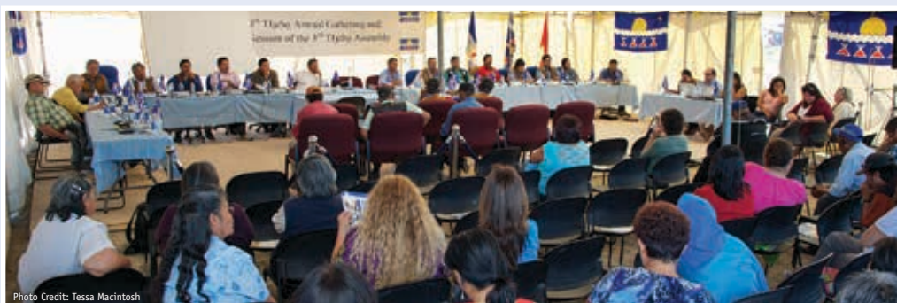
The Assembly session at the Annual Gathering