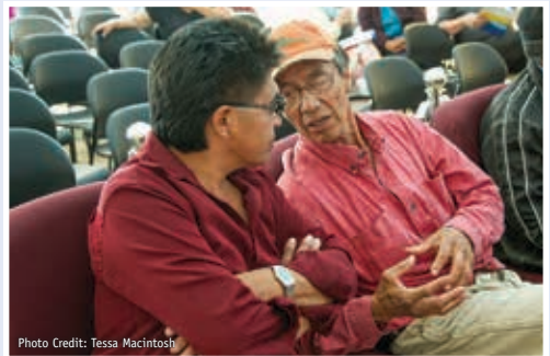
Discussion at the Annual Gathering