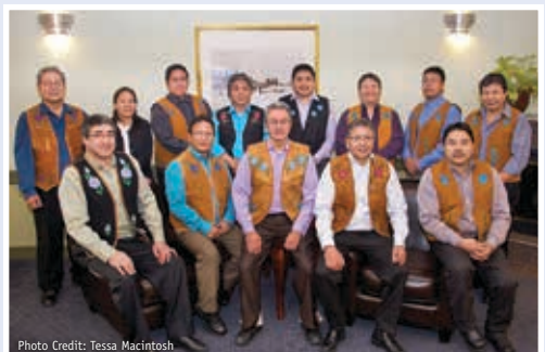
Tłıchǰ Assembly Members

The Assembly members, Chiefs and senior staff met in November 2013 to identify priorities and plan activities for the next four years of the 3rd Tłıchǰ Assembly. The Tłıchǰ Assembly approved six core intentions for 2013-2017, including sustaining our lands and environment, sustaining our language, culture and way of life, strengthening our communities and our people, increasing financial strength and economic development, strengthening Tłıchǰ Government institutions and organizations, and developing effective intergovernmental relationships.