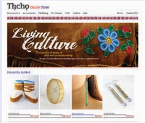
The Online Store at www.tlcho.ca http://www.tlcho.ca

We have provided funding to support post-secondary students in education, promoted recreational activities with school age students, provided harvest subsidies to all citizens and crisis funding to families who have members who are severely sick, while bringing together elders and families for funerals.