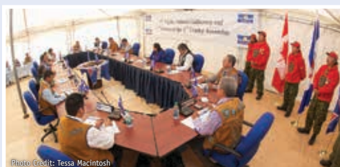
Tłı̨chǫ Assembly during the Annual Gathering

Legislation passed by the Assembly this past year included the Tłı̨chǫ Government Audited Financial Statements, the Tłı̨chǫ Government Budget Law 2014-2015, Northwest Territories Lands and Resources Devolution Agreement Law, Northwest Territories Intergovernmental Agreement on Lands and Resources Management Law, and the Northwest Territories Intergovernmental Resource Revenue Sharing Agreement Law.