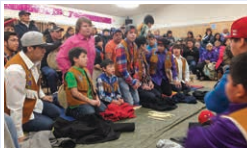
The Youth Hand Games Tournament in Behchokò

Other Tłıchọ Government programs related to “cultural practices” all contribute to an active and vibrant cultural life in our communities. These include hunters and trappers assistance, the development of an online market for handcrafts, which provides incentives for people to continue making traditional Tłıchọ clothing and art, and events such as the annual youth and men’s hand game tournaments.