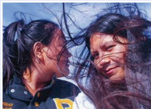
Ìmbè Program Participants