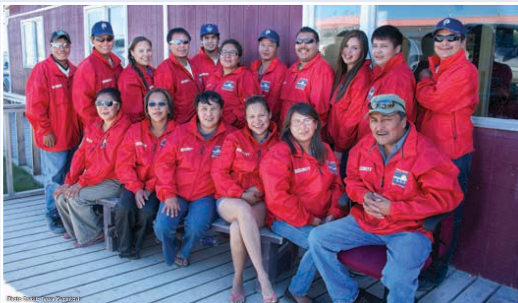
Security Staff during the Annual Gathering