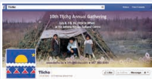
Tłı̨chǫ Government at www.facebook.com/Tlı̨chǫ