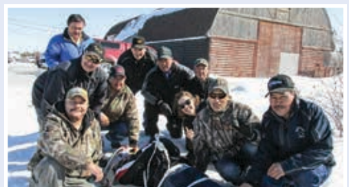
Wilderness Safety Program Participants

2013-2014 saw the implementation by the Tłı̨chǫ Government of a comprehensive Occupational Health and Safety strategy for both the office workplace and for projects on the land. A committee of management and staff developed comprehensive policies and an implementation strategy. Managers, including the Community Directors, received extensive training in workplace safety issues and an introduction to the Wilderness Safety Program.