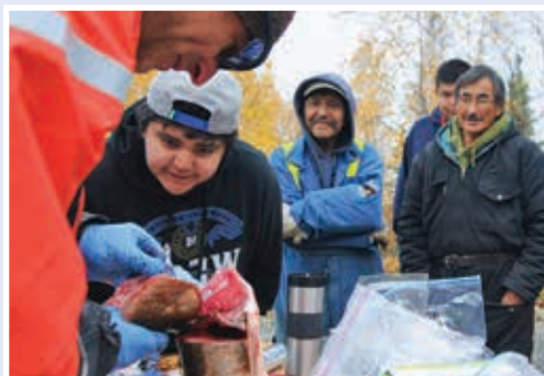
Monitoring Fish Health in Gameti

In 2013-2014 we have been working to build Tłıchọ capacity to monitor and manage Tłıchọ lands. We have been training community members how to be the eyes and ears on Tłıchọ lands, so that, as we move forward with the implementation of the Tłıchọ Wenek’e (Land Use Plan), we will have comfort in the continued practice of traditional activities on Tłıchọ lands.